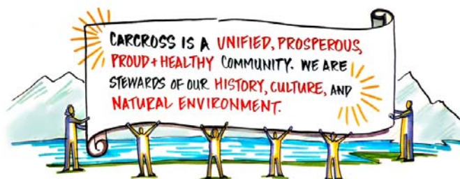
Carcross Local Area Plan Vision Statement