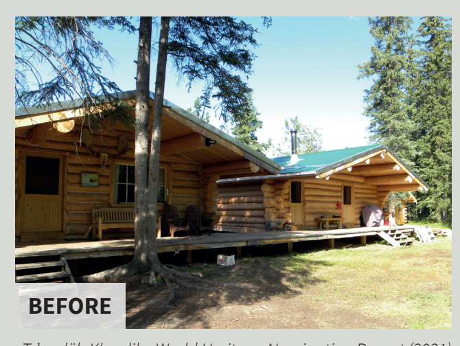
Government of Yukon, 2023